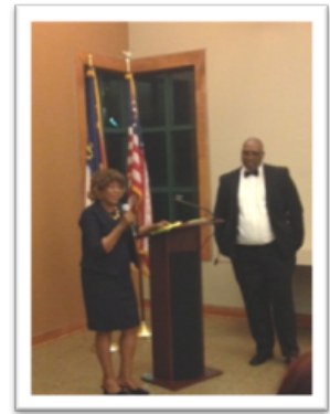
Senator Joyce Waddell explains the minimum wage bill to Union workers on October 17, 2015.