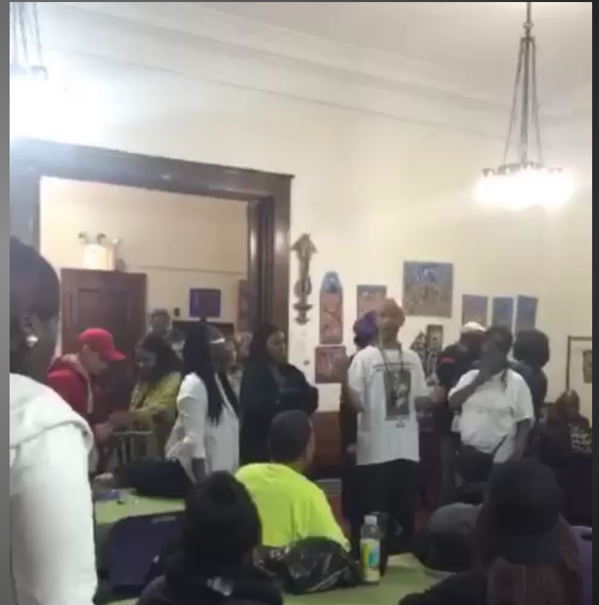
Family Fellowship. Press Play.