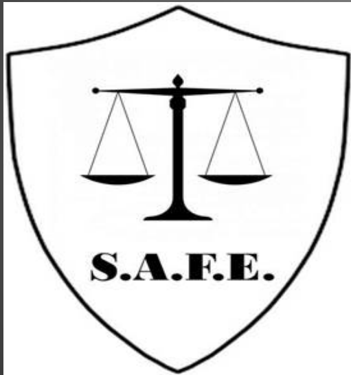
SAFE Coalition NC