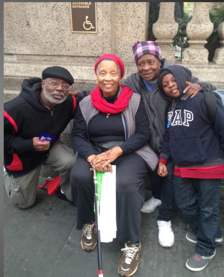
Carl with Legendary Activist Efia Nwangaza