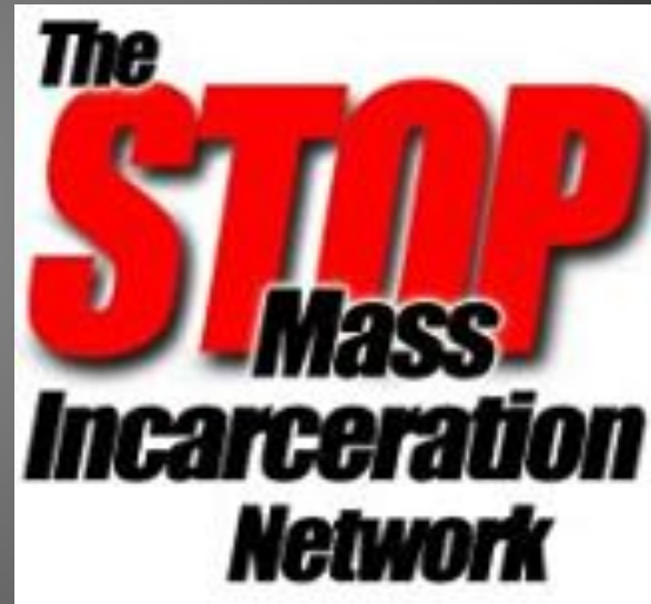
Stop Mass Incarceration Network Greensboro Chapter