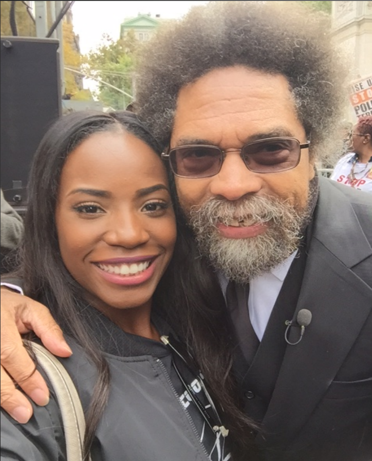
Paris Bey with Cornel West