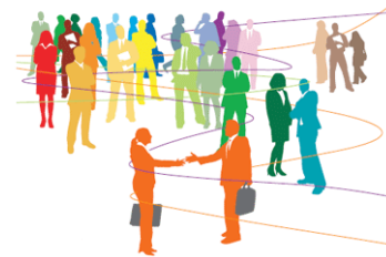
Queen City's Largest Networking Event