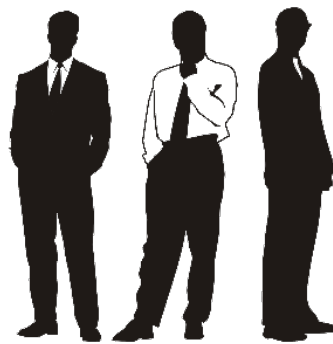
Empowering the Male