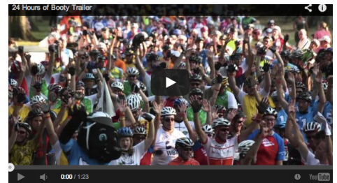
24 Hours of Booty Trailer