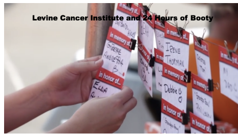
Levine Cancer Institute and 24 Hours of Booty