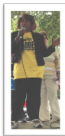
Senator Waddell addresses the audience and brings greetings from Senate District 40 at the Hickory Grove Parade and Celebration on July 4, 2015.