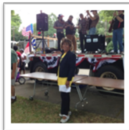
Senator Waddell enjoys the great music and fellowship at the Hickory Grove Parade and Celebration on July 4, 2015.