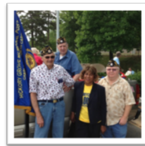
Senator Waddell congratulates our courageous veterans for their great service to the United States of America.