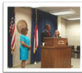
Senator Waddell and members of the Senate Democratic Caucus discuss the pending Senate budget Release at the Press Conference on June 10, 2015.