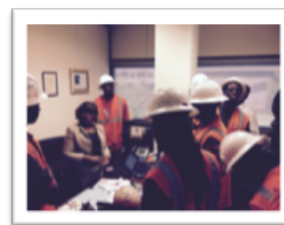
Senator Waddell Meets with NC Solar to Discuss House Bill 332, Energy Policy Amendments, on Tuesday, June 2, 2015.