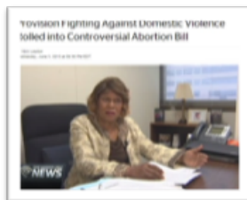
Senator Waddell interviewed with Time Warner Cable News on Wednesday, June 3, 2015, to share her views on House Bill 465, Women and Children's Protection Act of 2015.