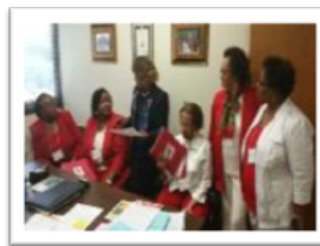
On Delta Day at the Capitol, Members of the Delta Sigma Theta Sorority Visited to Discuss Requests for Legislation