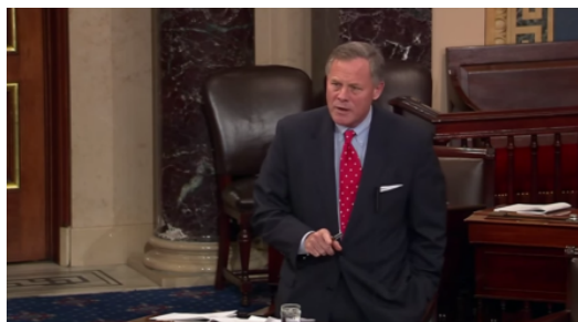
Senator Burr Speaks on the floor about simplifying the student loan repayment programs

North Carolinians are tired of seeing their hard-earned tax dollars go to waste in a student loan program that serves neither their interests nor those of the college students it is intended to help. You can hear more about the Amendment 62 by watching by floor speech below.