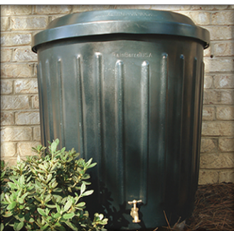
Rain Barrel USA, 60 gallon rain barrel

Rain Barrels are offered through a partnership with Charlotte-Mecklenburg Storm Water Services, allowing us to sell them to the public at a discounted price ($95.00 plus tax - 60 gallon rain barrel / $110.00 plus tax - 80 gallon rain barrel). Rain Barrels are for sell year-round and will be available for purchase at the annual tree seedling sale.