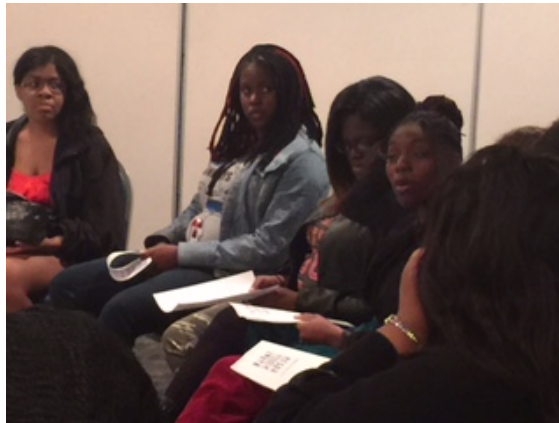
CHASF Scholars socialize at the Jingle Mingle!