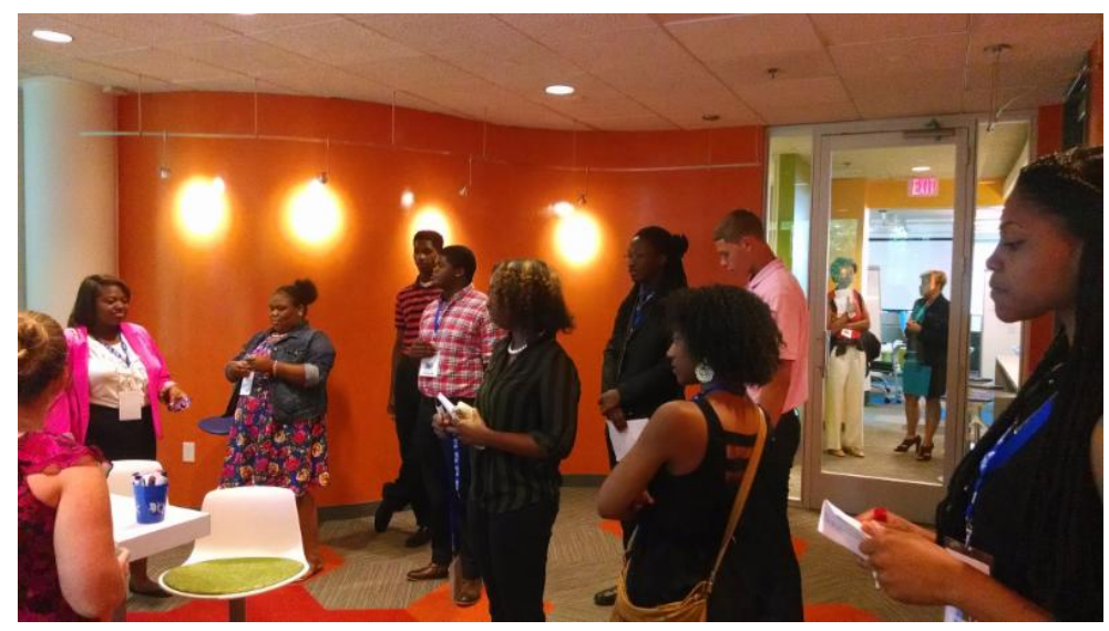
CHASF Scholars tour the Belk headquarters in Charlotte as guests of several Belk employee groups.

Belk employees coordinated the Third Annual "Day-in-the-Life at Belk" where a dozen Charlotte Housing Authority Scholarship Fund recipients spent a half-day at the headquarters meeting with professionals and learning the secrets of corporate success.