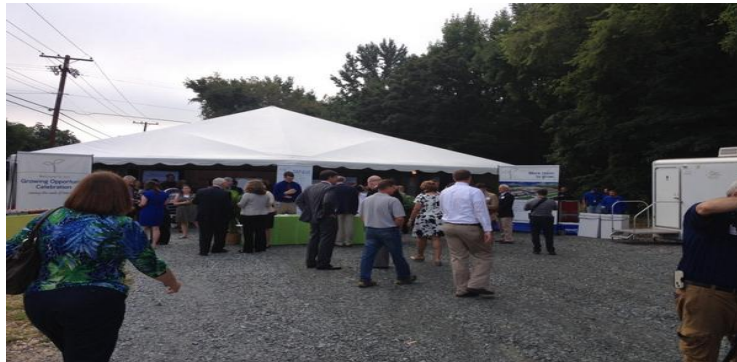
Citizens at the Goodwill Opportunity Celebration

After planning and collaborations, Goodwill Industries is now opening a 160,000 sq. ft. facility in District 3 that will continue to provide employment and resources to Charlotteans. Plans for the facility were revealed at a celebration on the grounds of the new facility.