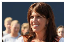
Report: Arrest warrant sought for ex-tennis champ ...