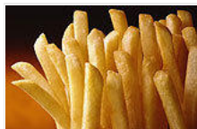
Worst foods to feed your child