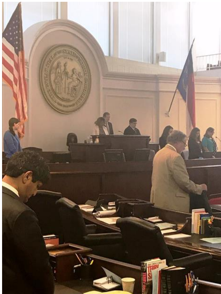
Senator Joyce Waddell leads the Senate Chamber in prayer at Session.