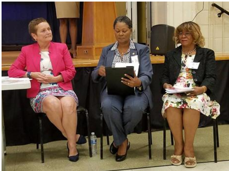
Senator Joyce Waddell gives a legislative update at the Democratic Women of Mecklenburg County's meeting.