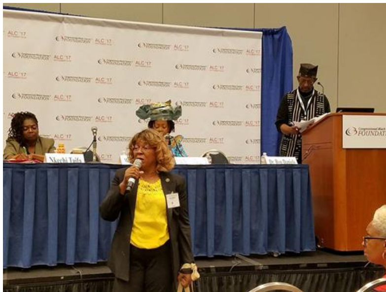
Senator Joyce Waddell addresses a Congressional Black Caucus Committee concerning reparations at the Annual Legislative Conference in Washington D.C.