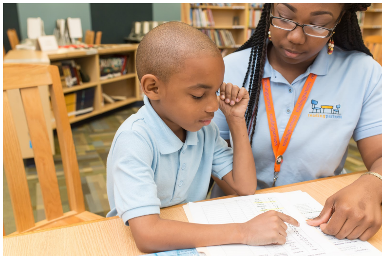
Reading Partners tutors work with their students

This email was sent to helen.kimbrough@readingpartners.org Reading Partners Charlotte, Hygge Coworking - 809 West Hill Street, Suite C, Charlotte, NC 28208, United States Unsubscribe