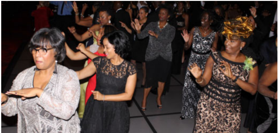
Gala guests enjoy the after-party with music provided by Big Blast & The Party Masters